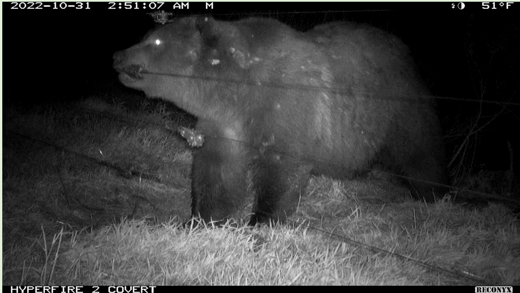
Electric fence with a failed battery