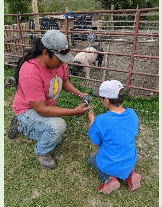
Specialist building an electric fencing with a 4H member